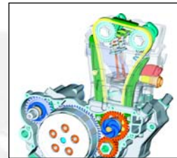
Additional SX specs on back.