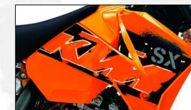
Appearance identical to full size bikes